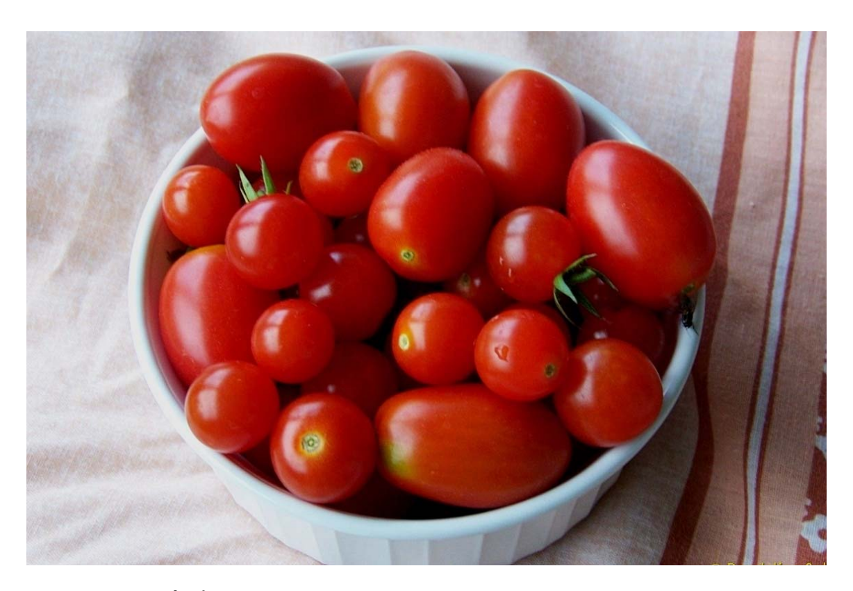
I like to eat tomatoes.