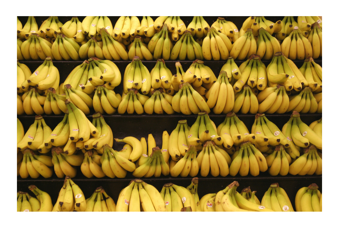
I like to eat bananas.