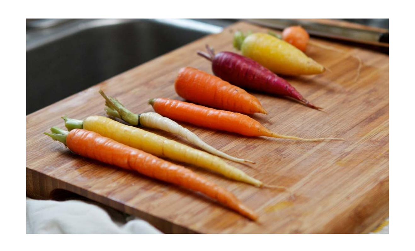
I like to eat carrots.