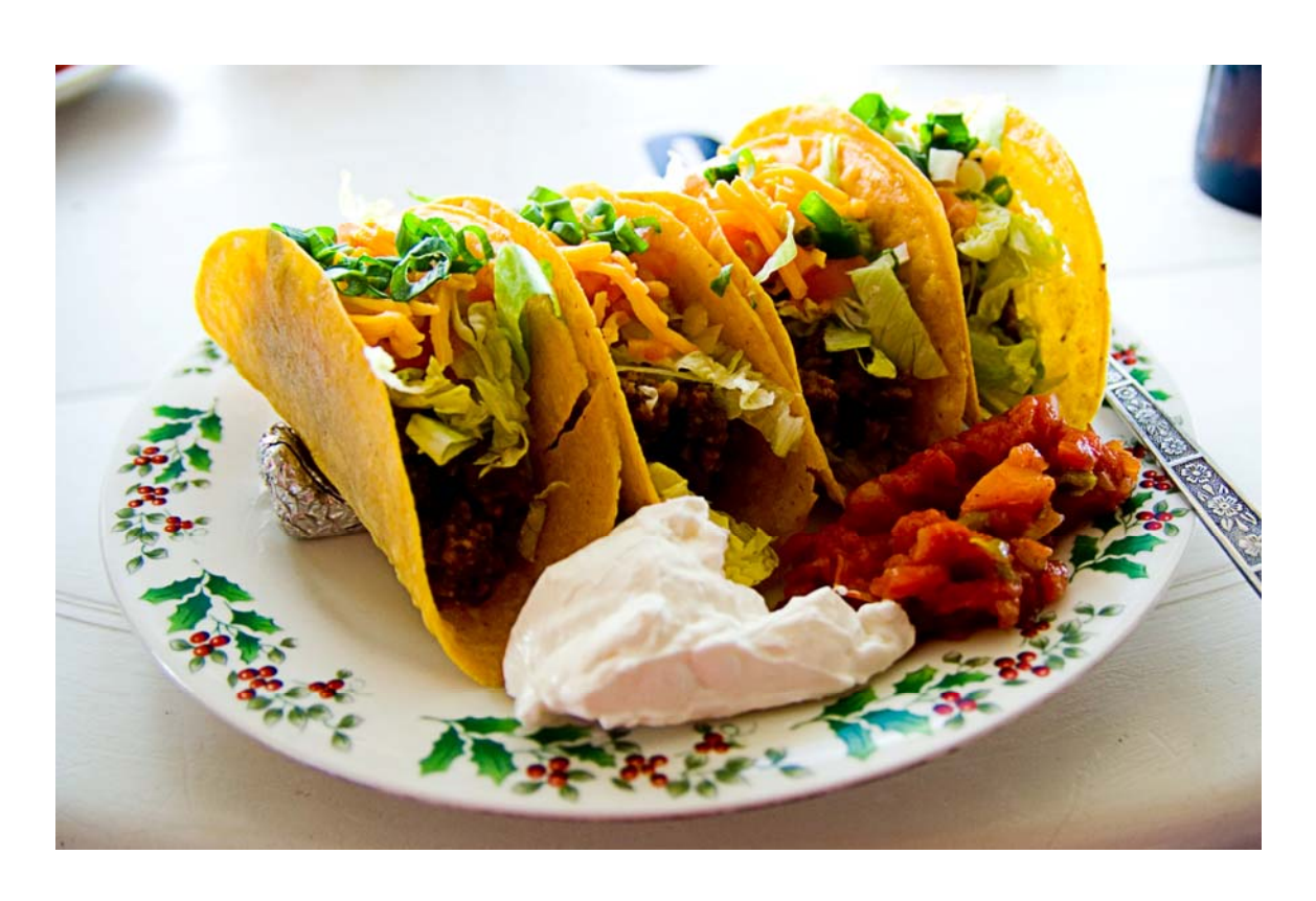
I like to eat tacos.