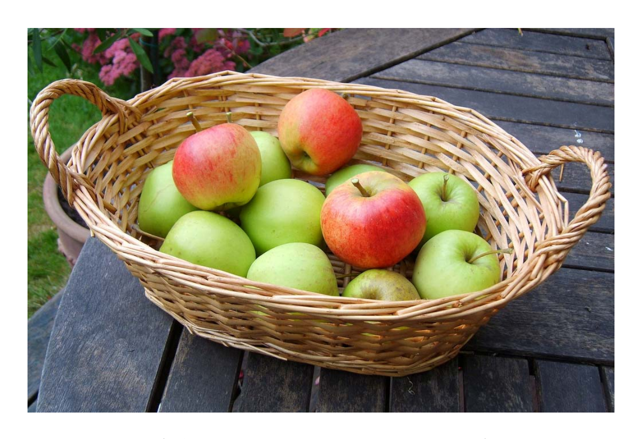
I like to eat apples.