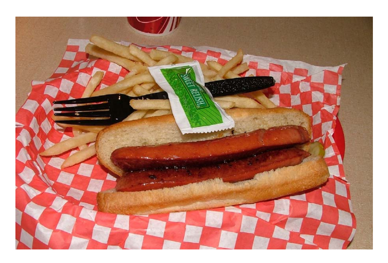
I like to eat hot dogs.