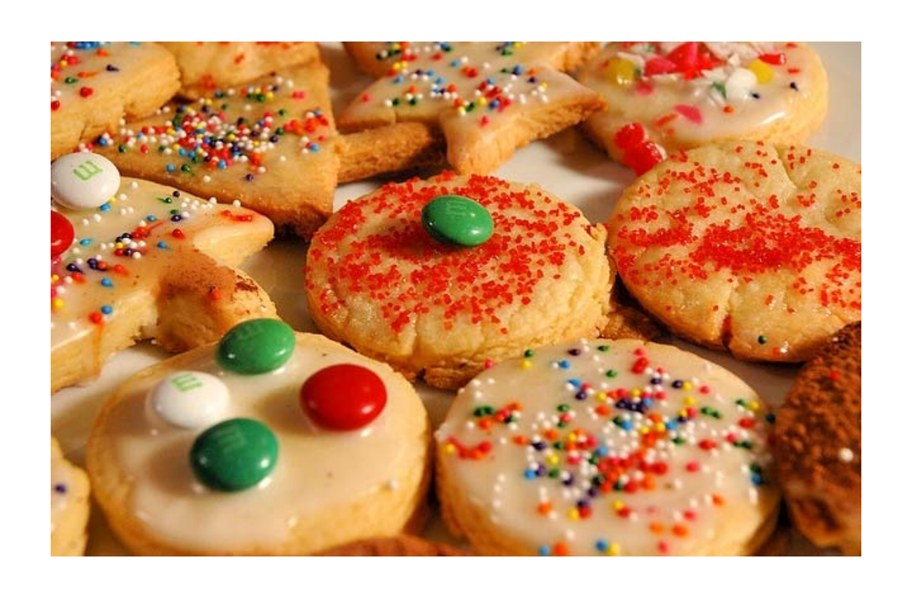
I like to eat cookies, too.